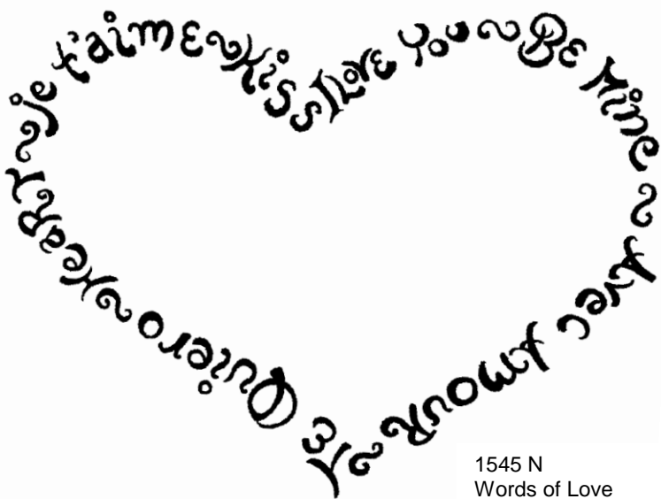
1545 N Words of Love