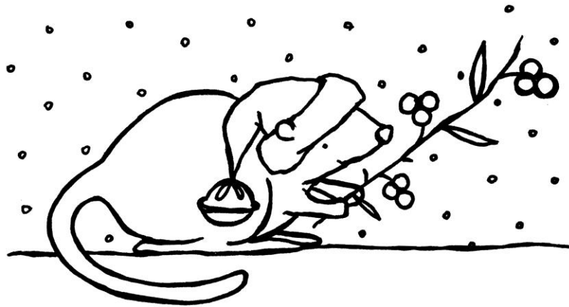
1635 N Christmas Mouse