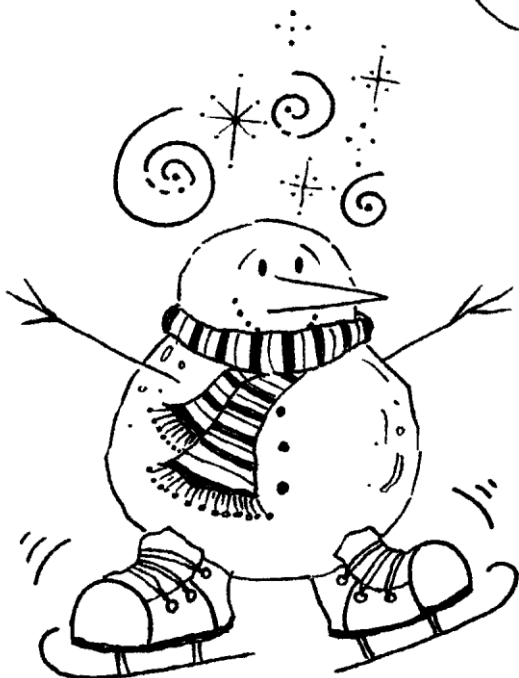
1585 M Snowman on Skates