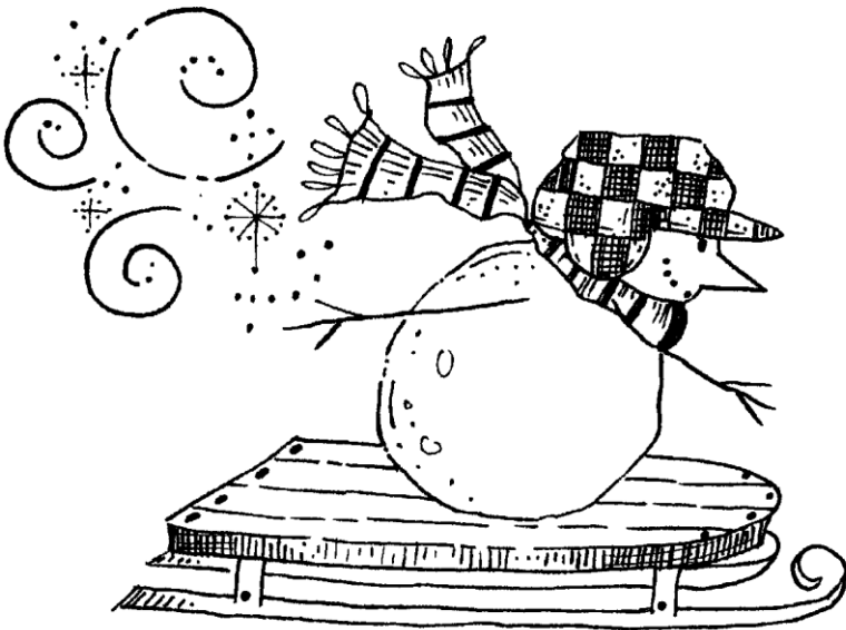
1583 O Sledding Snowman