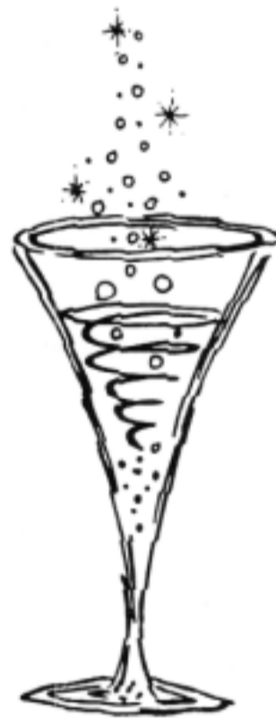
1312 H Cheers!