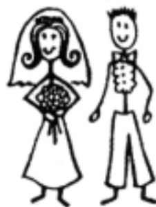
441 D Happy Couple