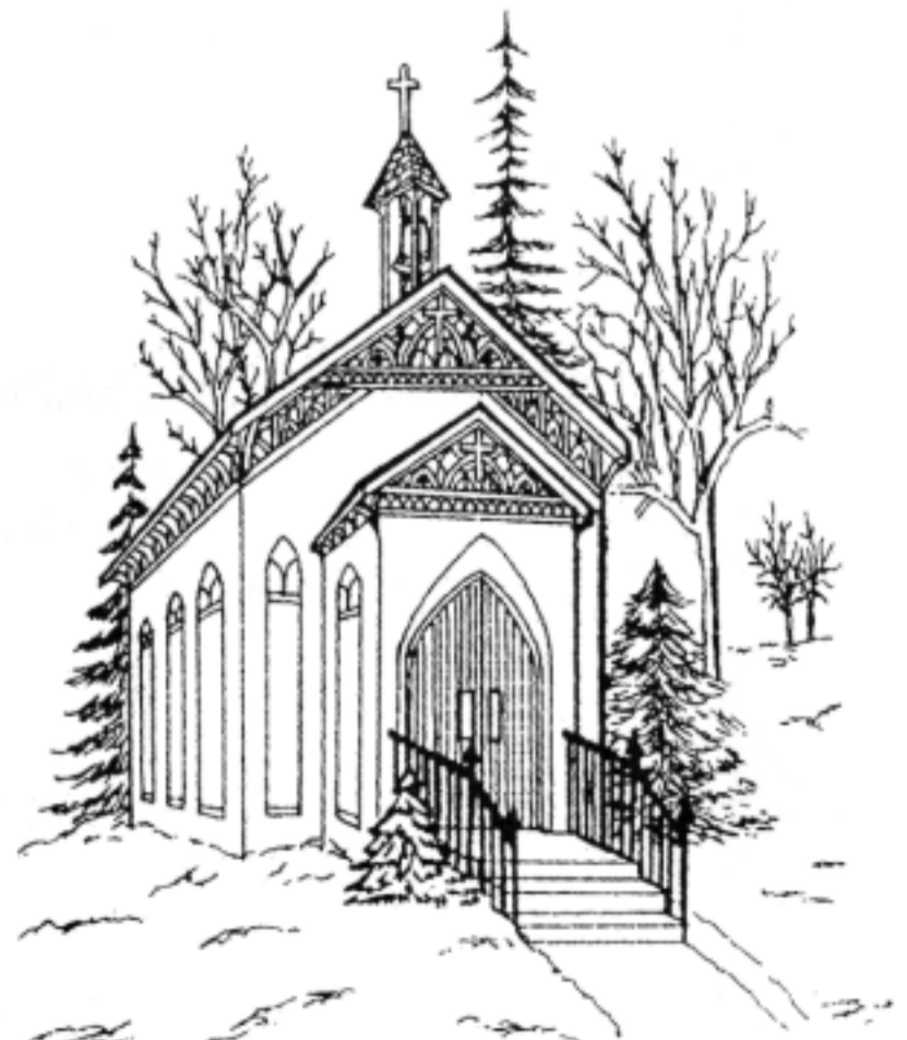
337 P Church