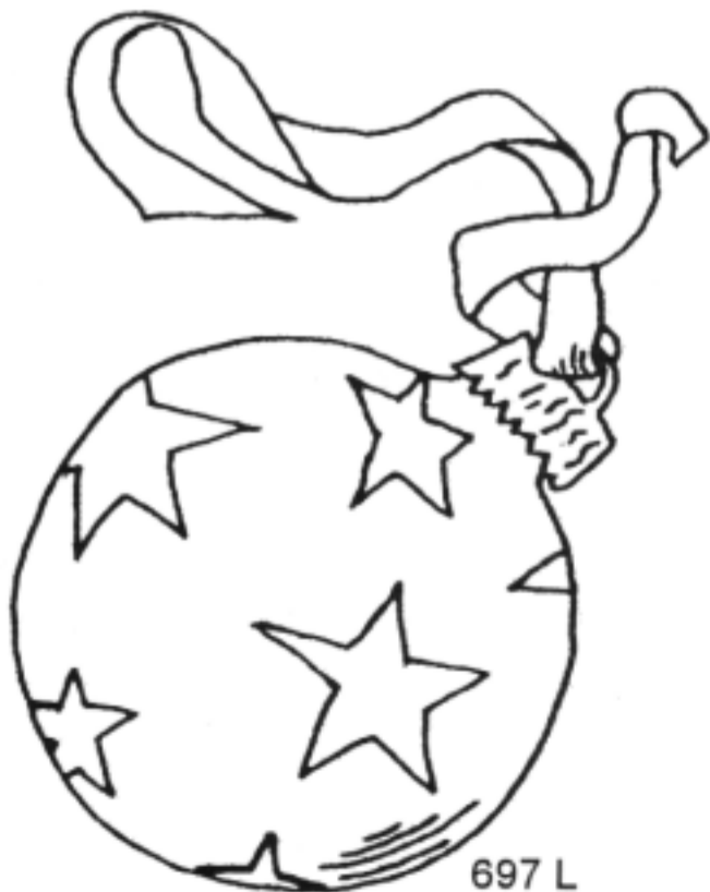
697 L Star Ornament