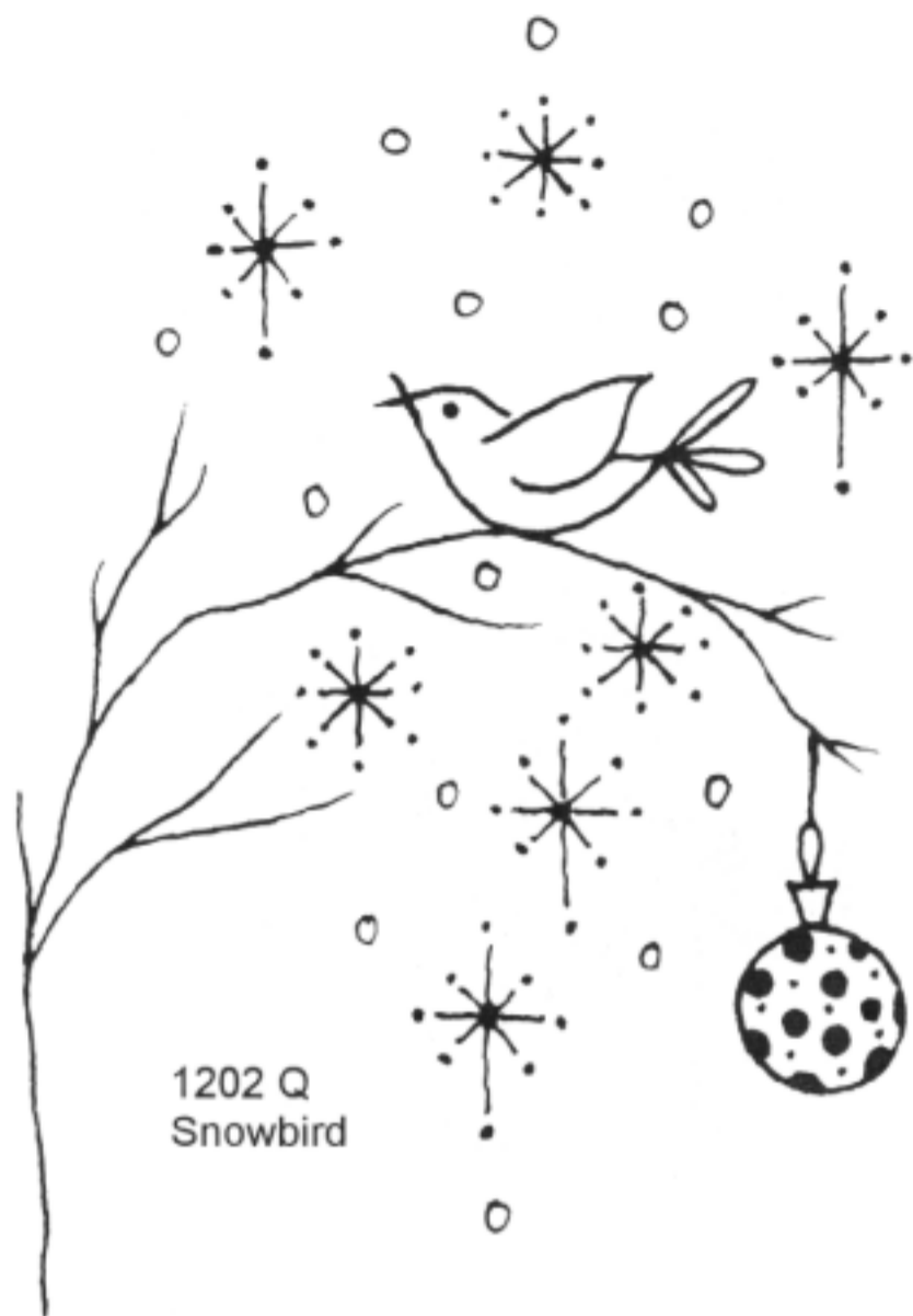
1202 Q Snowbird