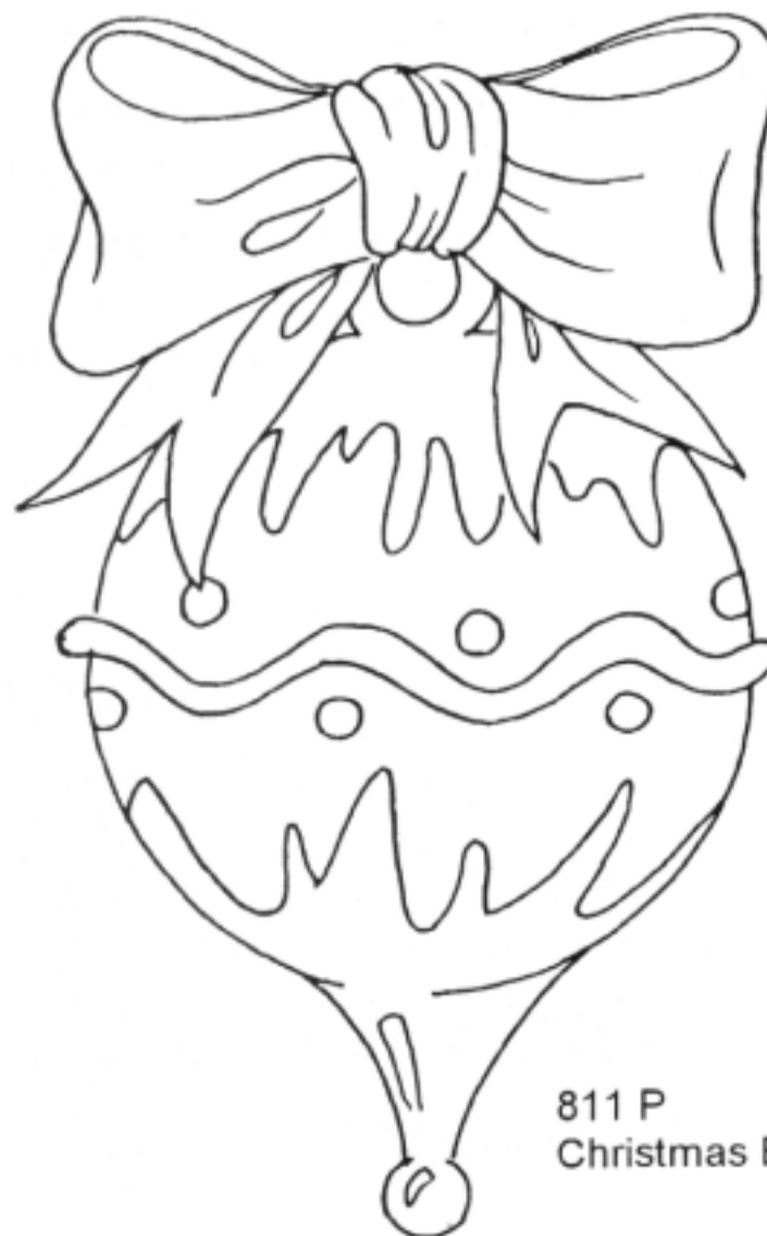
811 P Christmas Ball