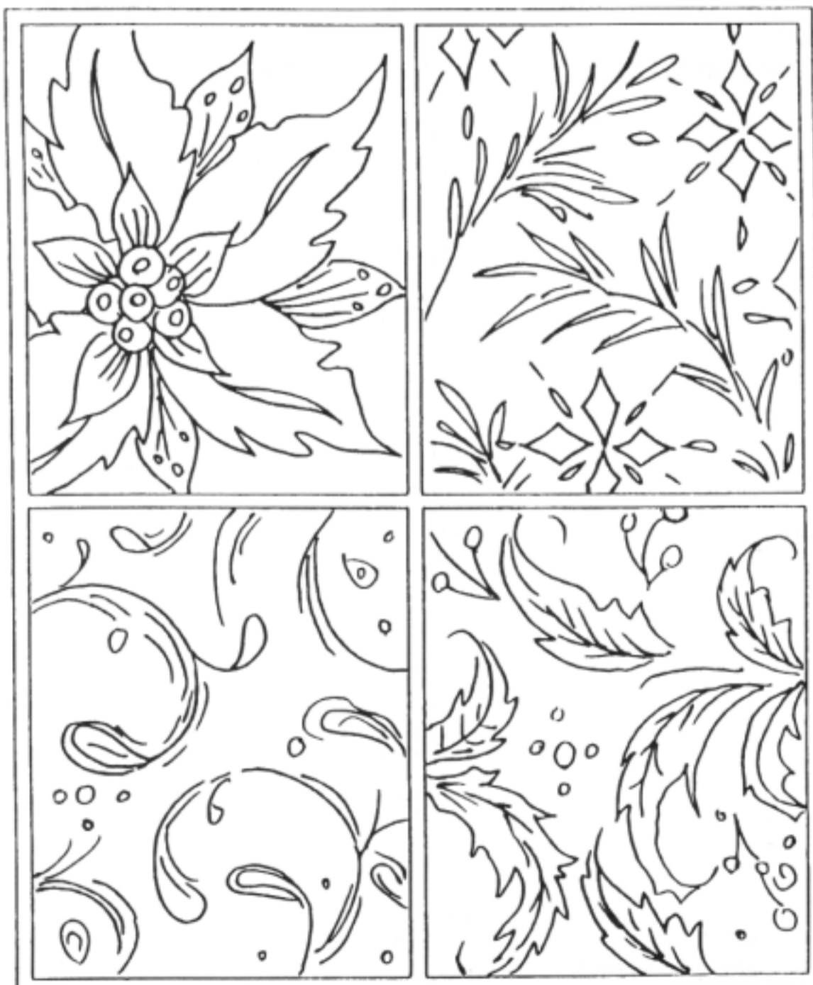
958 U Four Panes