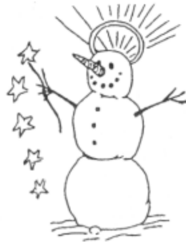
307 F Magic Snowman