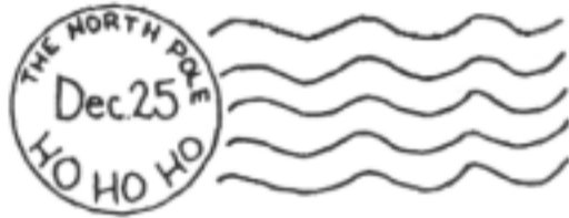
826 E North Pole