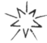
590 B Twinkle Star