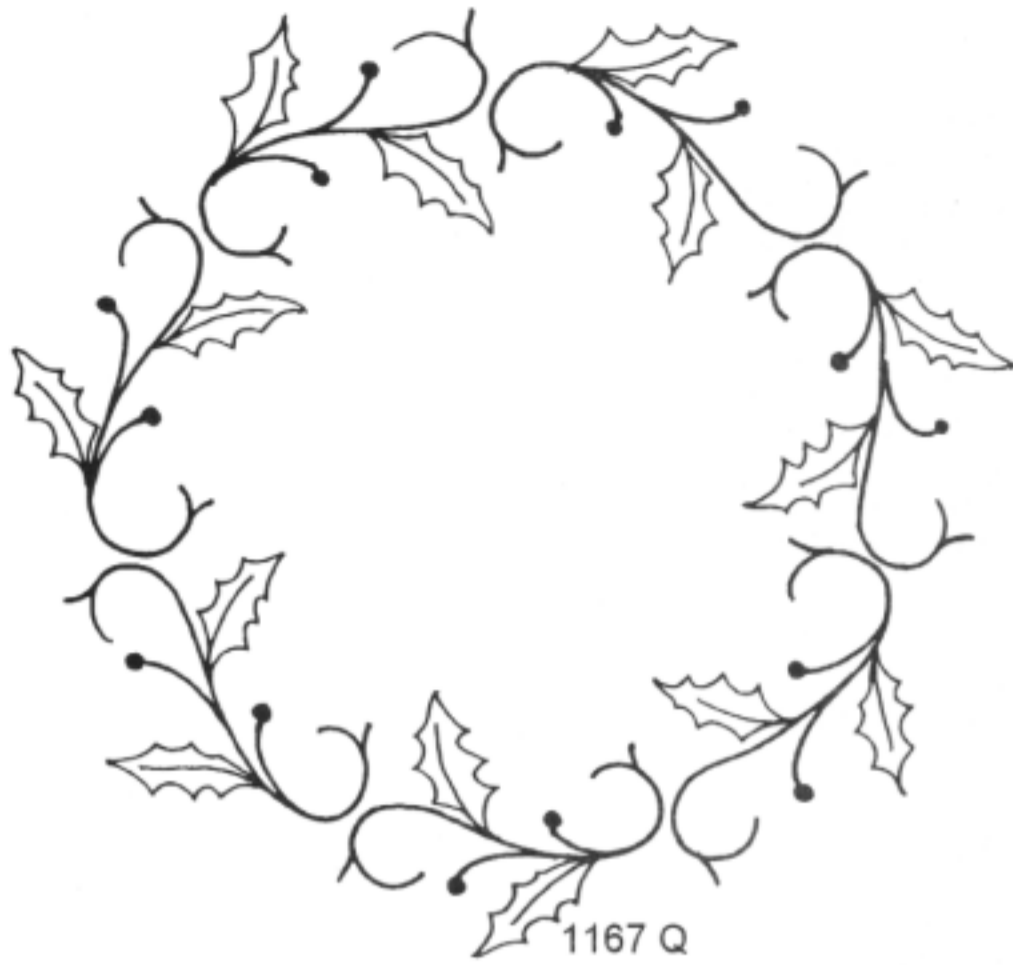
1167 Q Christmas Wreath