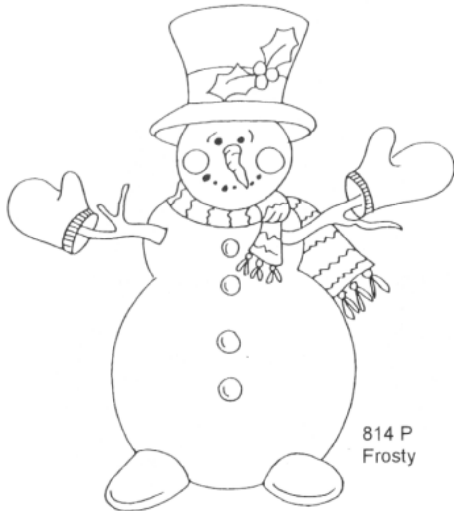
814 P Frosty