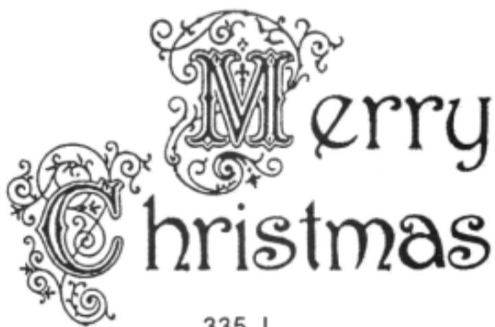
335 J Victorian Merry Christmas