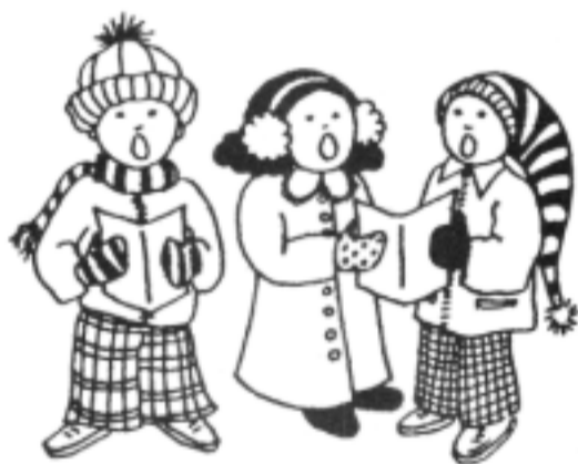
561 F Little Carolers