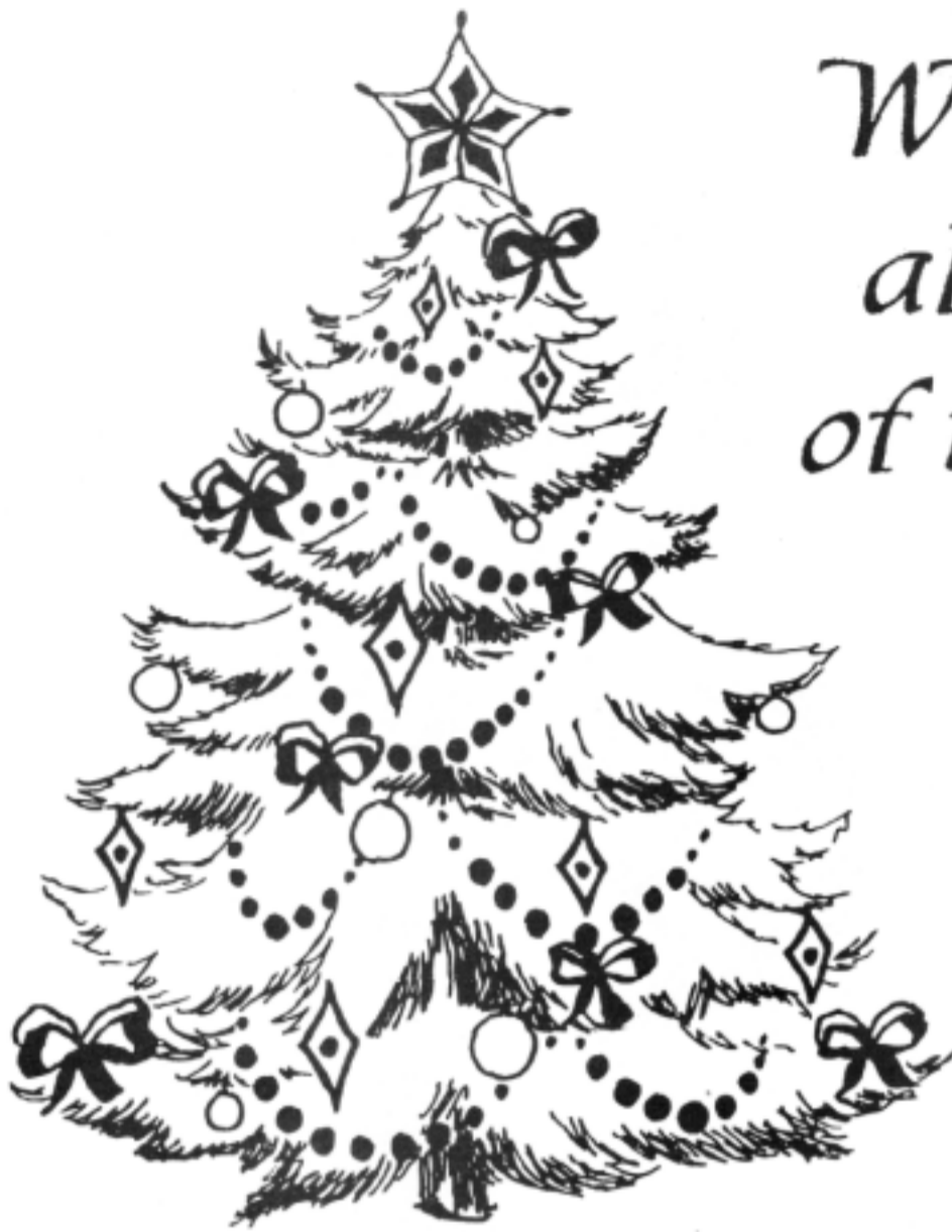
1133 R Christmas Tree