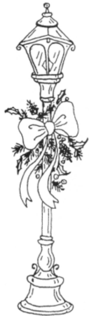
325 L Gaslight