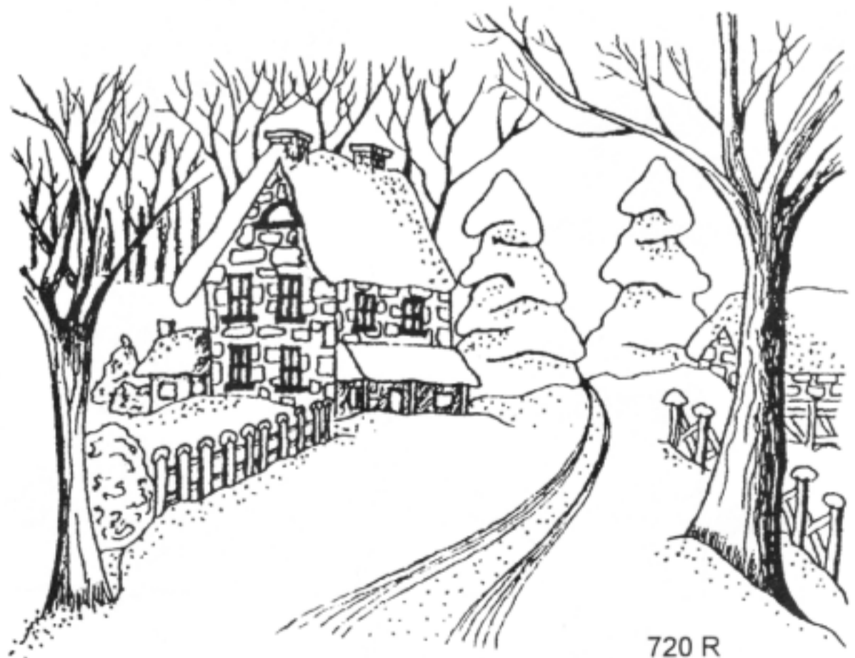
720 R Country Scene