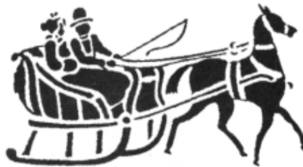
727 G Horse and Sleigh