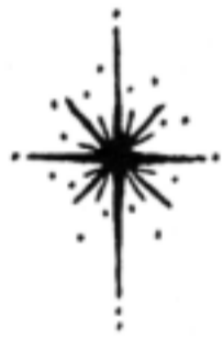
848 D Bright Star