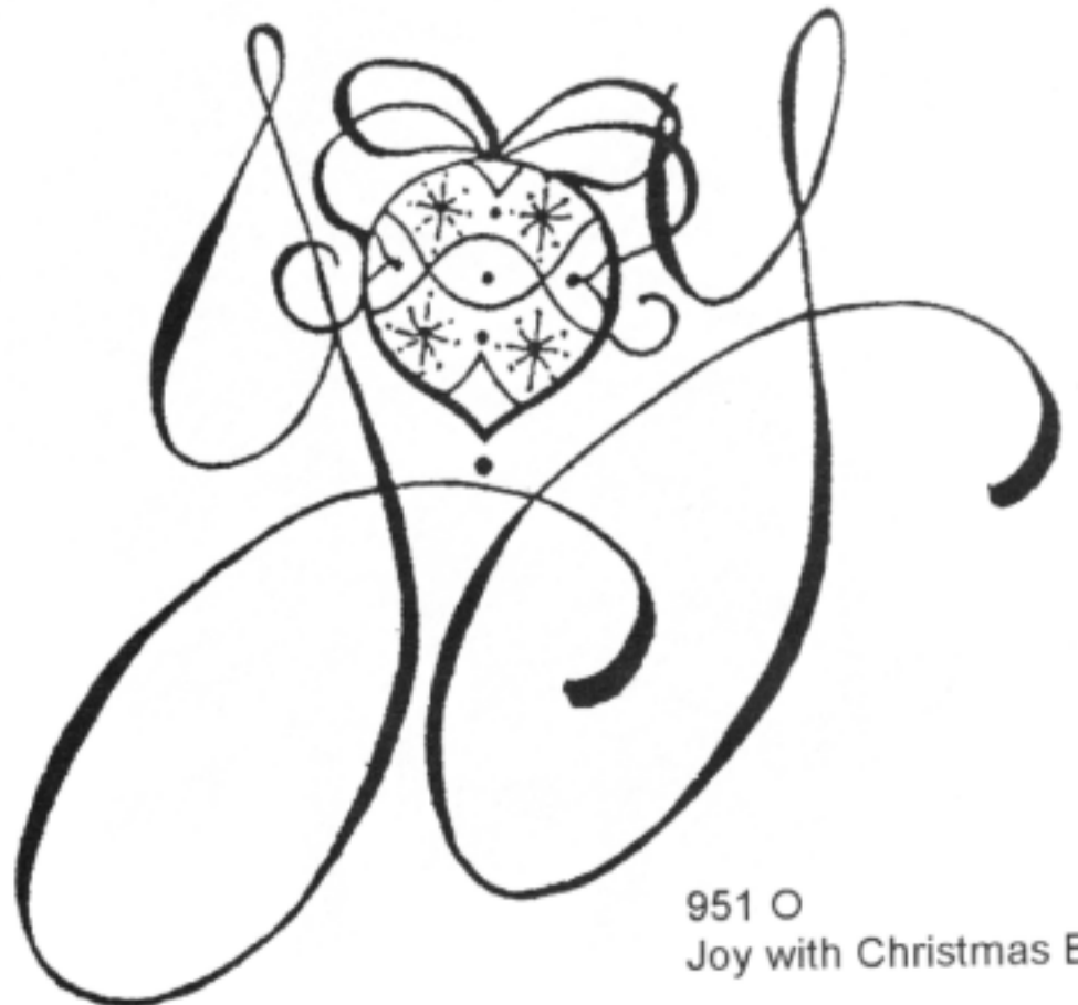
951 O Joy with Christmas Ball