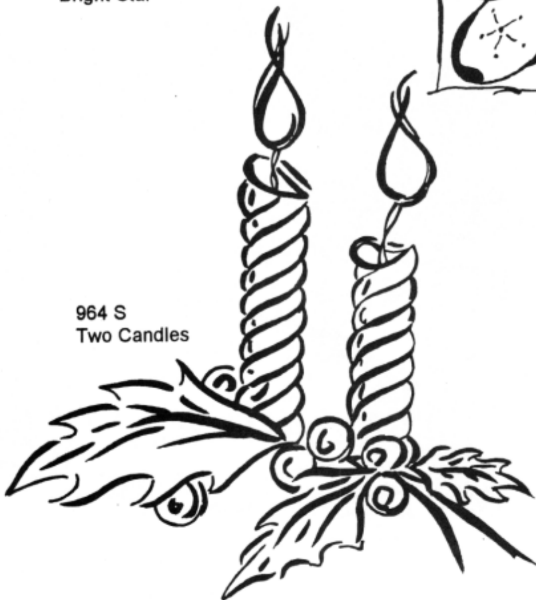
964 S Two Candles