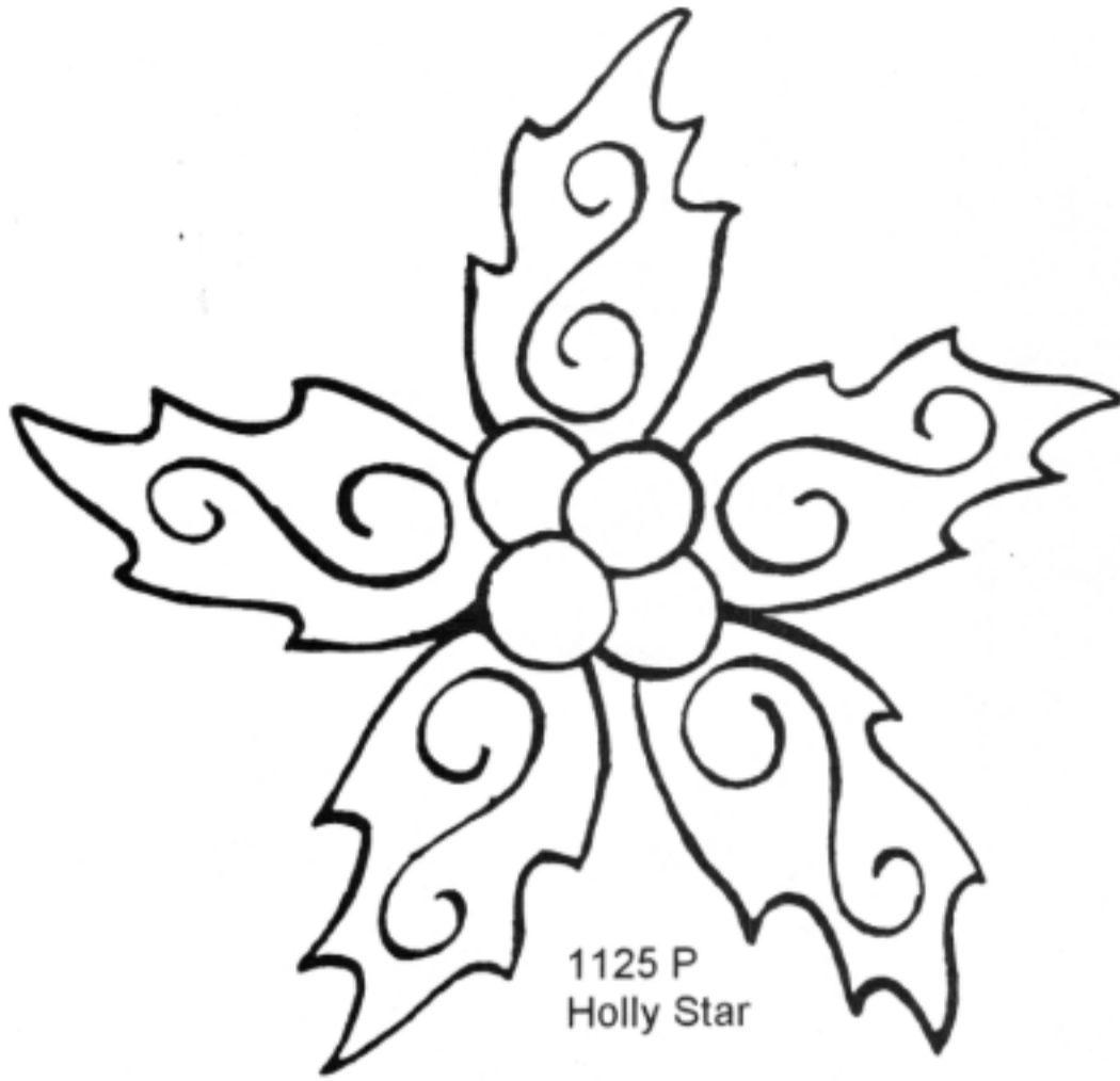
1125 P Holly Star