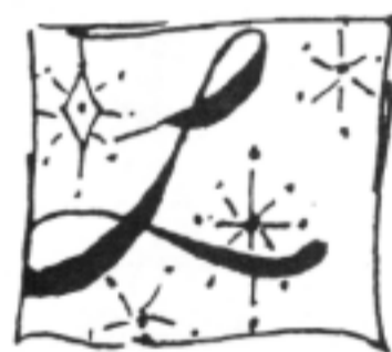
961 L Noel Frame