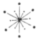
591 B Twinkle Flake