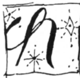
609 D To From